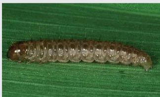
Preventing sod webworms is a matter of maintenance.

Two to three generations of sod webworms can hatch per year. When there are 15 or more per square yard, damage begins appearing in the form of large, patchy areas of grass that turn brown and die.