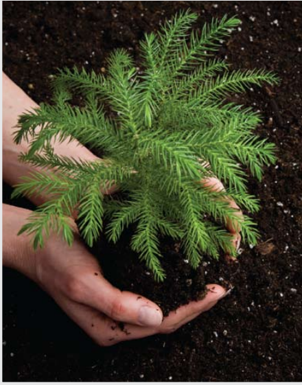
Tree planting is a great way to improve environmental quality while enhancing the looks of your landscape.

Planting a new tree will not only enhance the looks of your landscape, but it can help you save money on your energy bills while improving the environment we all share. Consider these statistics on the value of planting trees: