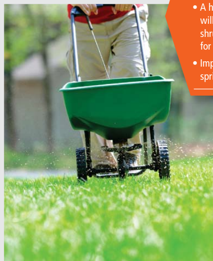
Your plants are counting on you for a heavy fall feeding.

At this point, plants begin expanding their root systems and filling them with nutrient reserves to