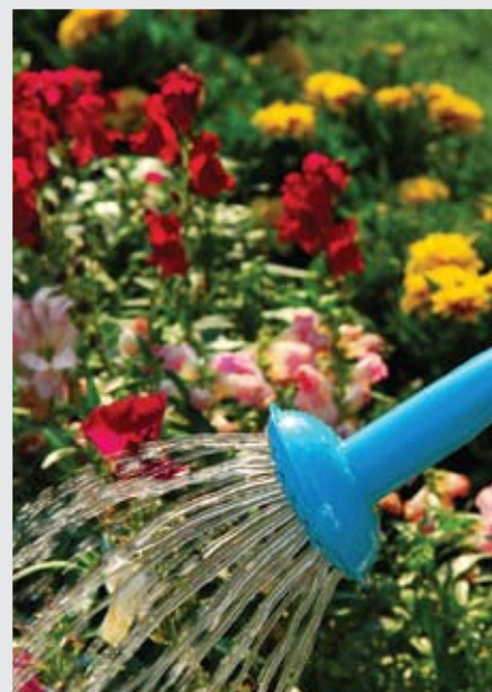
With the right watering and fertilizing practices, you can look forward to a fantastic flower display this year!