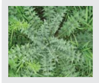
Broadleaf weeds can pop up at any time during the growing season.

Will our lawns ever be completely free of broadleaf weeds? It's unlikely. However, by combining proper maintenance practices with post-emergent spot treatments, we can significantly reduce the impact of these pests on our turf.