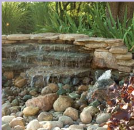
Liven up your landscape with a disappearing water feature!

Besides being safe for children and pets, disappearing water features have few maintenance needs, and there aren’t any open bodies of water to collect algae and other debris. Consider one as a magical addition to your landscape!