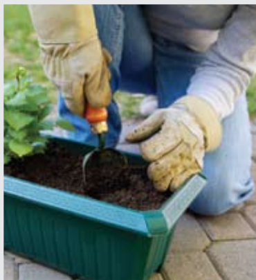
You can save money on container gardening with homemade potting mix.

Trying out a variety of different mixes will help to determine the best one for your specific needs. Just be sure that the ingredients you use are somewhat moist before mixing. Also, it's a good idea to add a timed-release fertilizer to your mix when planting.