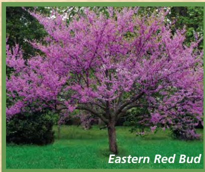
Eastern Red Bud

Reaches 30' in height, with red twigs and beautiful purplish-pink flowers in the spring.