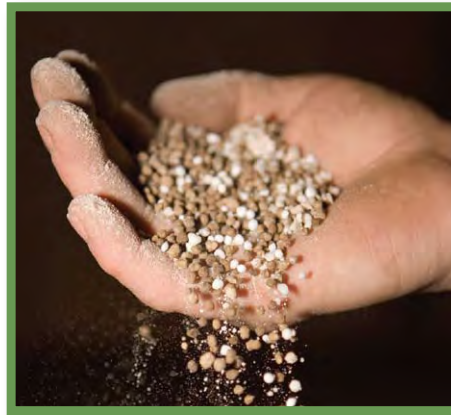
Fertilizer for lawns, trees and shrubs does its best work in the fall.

A heavy fall fertilization, on the other hand, promotes a thicker, stronger root system rather than excessive top growth. This will lead to a greener, more vigorous lawn when spring returns.