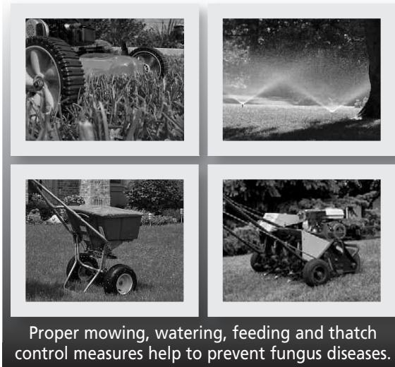
Proper mowing, watering, feeding and thatch control measures help to prevent fungus diseases.

However, it's best to try and prevent fungus diseases from gaining a foothold in your lawn. You can do this by keeping your turf healthy and growing with the practices shown at right.