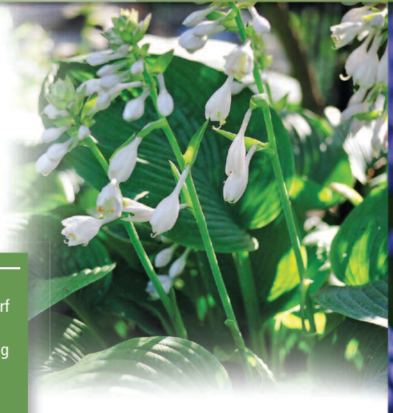
These hostas serve as an eye-catching turf alternative.