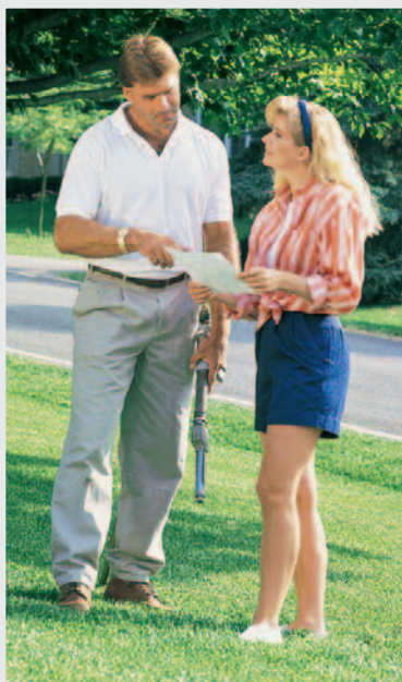
Working together, we can help your property reach its true potential.

We'll be providing you with this newsletter and other important information all season long to help you get the most from your investment. As always, please feel free to call us anytime with your questions and concerns. We're looking forward to working with you, and we appreciate your business!