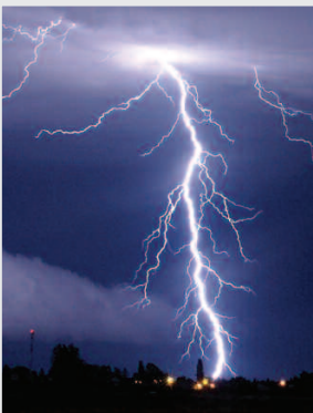
Lightning strikes can make plants greener!

It's estimated that about 250,000 tons of nitrogen are produced by roughly 1,800 thunderstorms every day!