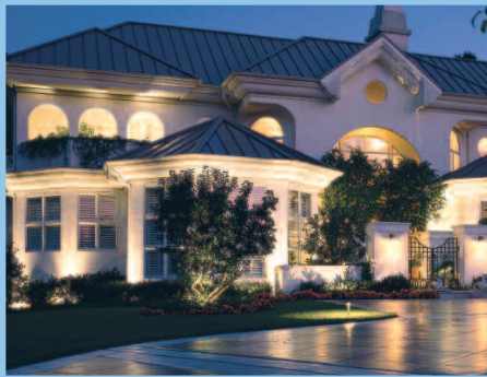
Why stop enjoying your property just because the sun went down?