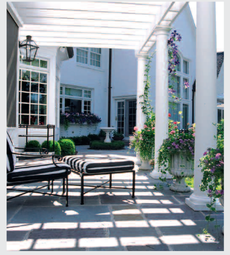
The design of your patio should be dictated by how you want to use it.

Above all else, be sure to take your time and think ahead. By planning carefully, you'll be much happier with the end result!