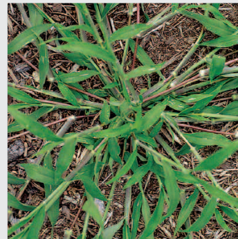
One crabgrass plant can produce thousands of seeds per season.

emergents make it much more difficult for crabgrass plants to grow. For best results, pre-emergents should be applied in the early spring before crabgrass seeds start sprouting. And if you're planning on seeding your lawn, it's a good idea to wait six to eight weeks after pre-emergents have been applied. Otherwise, they can prevent your new grass seed from sprouting as well.