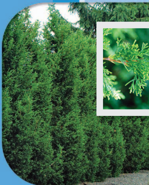
Juniper trees are a great choice for a hardy, natural screen.