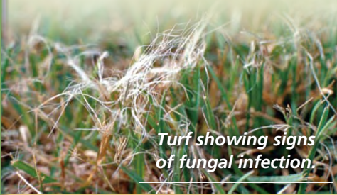
Turf showing signs of fungal infection.

Answers to photo puzzle: 1. There is a butterfly in the red tulips. 2. Red tulips have been added in the foreground. 3. A bird feeder is hanging from the tree. 4. There are ducks in the water.