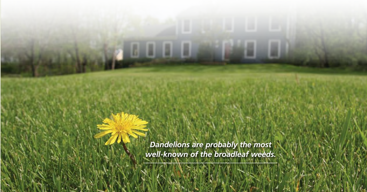
Dandelions are probably the most well-known of the broadleaf weeds.

Broadleaf weed control is an ongoing battle that is definitely worth fighting. With proper care and maintenance practices, along with post-emergent herbicide treatments as needed, these pushy pests can be managed effectively.