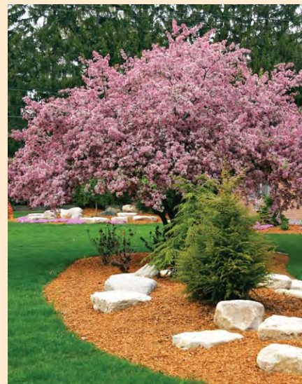
Mulch will improve the looks and health of any planting bed.

There's no time like the present for a mulch application. Your plants will thank you for it!