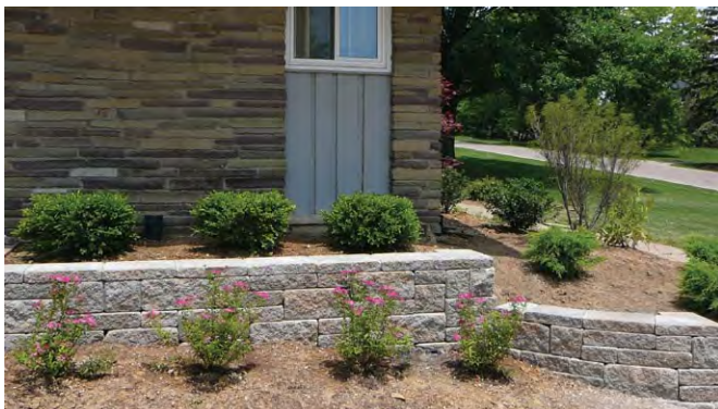
Newly planted shrubs ready for a fresh layer of mulch.

Installing new trees and shrubs is a great way to improve both the looks and value of your property. With the right care after planting, you can expect your new additions to provide many years of beautiful growth.