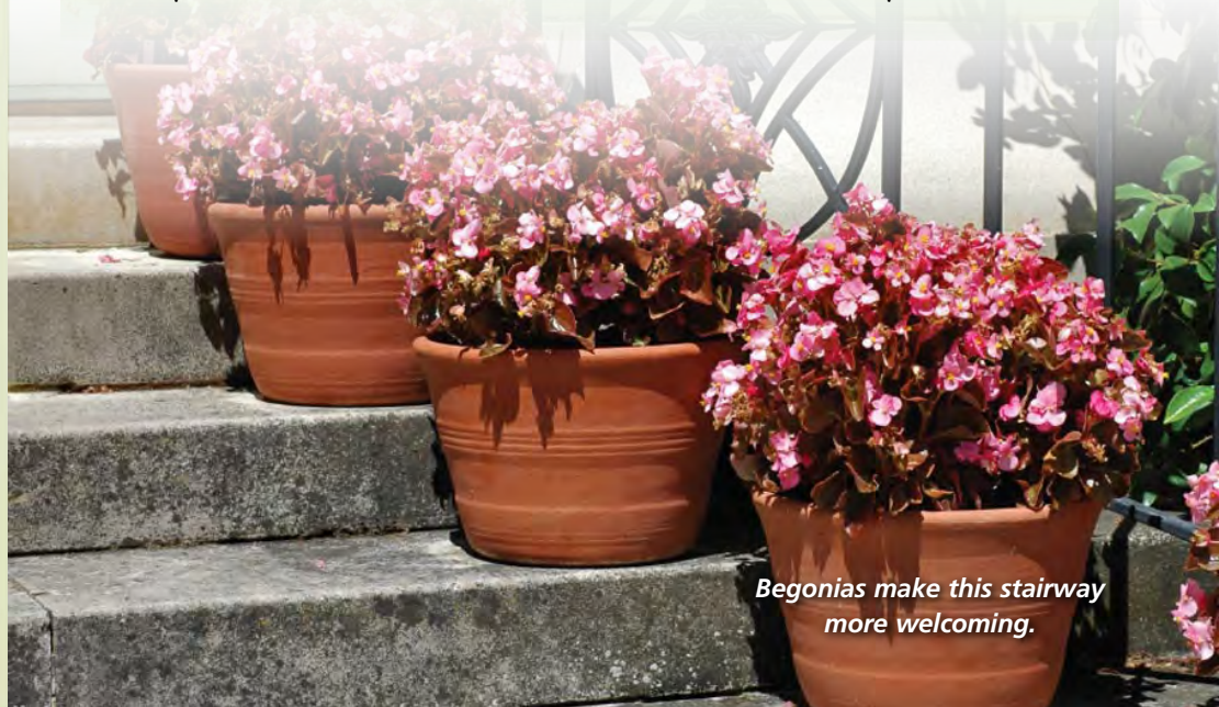
Begonias make this stairway more welcoming.