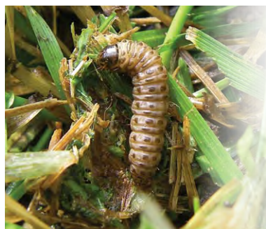
A webworm caught in the act.

GREENBUG APHIDS – Like chinch bugs, suck juices from grass plants while injecting a toxin.